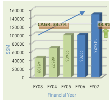
Regional & Lifestyle Centres