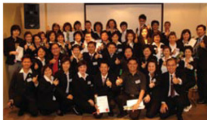
Malaysia 马来西亚 Top marks for this fabulous course! “我们给这一级棒的课程满分！”