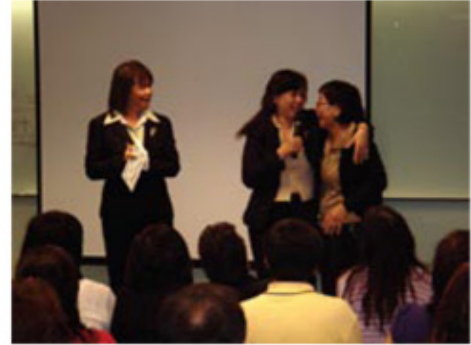
Smiles, laughter, hugs – it's all in the family. 不间断的笑容、笑声、拥抱。多温馨的一个大家庭!