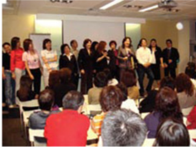
"Mark our words: We will scale new levels of success!" "我们一定会再攀新的高峰!"