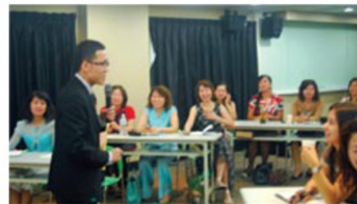
Taiwan 台湾 Grooming tomorrow's finest public speakers. 决心栽培明日最优秀的公共演讲者。