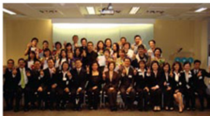
Singapore 新加坡 105 attendees smile with their hearts. 105名出席者发出欣慰的微笑。

Take a peek at the latest goings-on at our training sessions! 欢迎参观我们的最新受训过程！